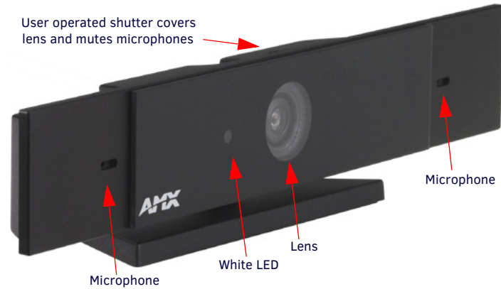
FIG. 1 NMX-VCC-1000 SERENO VIDEO CAMERA

The NMX-VCC-1000 Sereno Video Conferencing Camera (FG3211-10) is purpose-built for use with conferencing applications in huddle spaces and smaller meeting rooms. Sereno provides HD quality video, 120 degree field of view, and outstanding voice capture to deliver exceptional conference experiences.