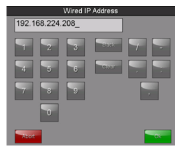
FIG. 7 WIRED IP ADDRESS KEYBOARD

B. Enter the server's IP address and click OK .