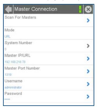
FIG. 8 MASTER CONNECTION PAGE

In the Connection & Networks page, select Master Connection to open the Master Connection page (FIG. 8).