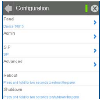
FIG. 4 CONFIGURATION PAGE