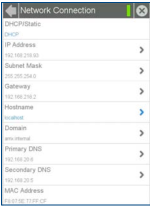
FIG. 6 NETWORK CONNECTION PAGE

1. Select Network Connection to open the Network Connection page (FIG. 6).