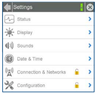
FIG. 3 SETTINGS MENU

To access the Settings menu, press and hold the Sleep button on the top of the panel for 3 seconds. This invokes an on-screen prompt to release the button to enter the main Settings page (FIG. 3).