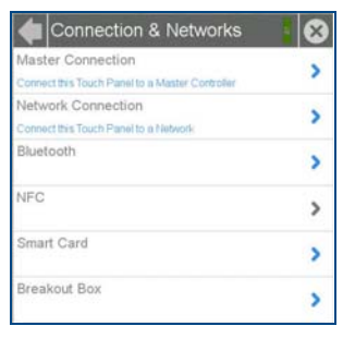
FIG. 5 CONNECTION & NETWORKS PAGE