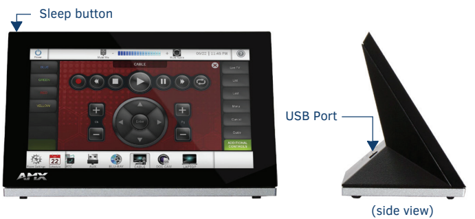
FIG. 1 MT-702

The MT-702 (FG5969-53) 7" Modero G5 Tabletop Touch Panel features the G5 Graphic Engine, Quad Core Processor, and a capacitive multi-touch display. The touch panel features advanced technology empowering users to operate AV equipment seamlessly, while providing the ultimate in audio and video auality.