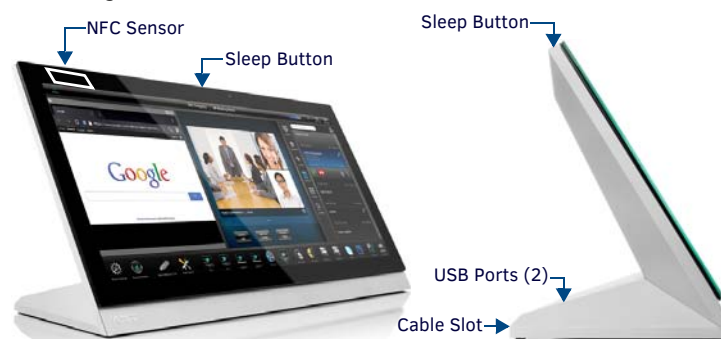
FIG. 1 MXT-2000XL-PAN

The MXT-2000XL-PAN 20.3" Modero X Series<sup>®</sup> Panoramic Tabletop Touch Panel ( FG5968-01 ) features a beautiful, panoramic capacitive multi-touch screen that provides users access to multiple applications with minimal navigation. It is hardware-ready for support of Near Field Communication™ (NFC) Technology to allow personalization of the user experience and productivity enhancing capabilities through integration with NFC capable personal devices. The distinctive, low-profile design is engineered to sit perfectly on a table without obstructing views.