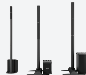
L1 Portable Line Array Systems