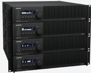
PowerMatch PM8500/8250/4500/4250 configurable power amplifiers