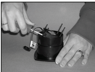
Figure 1: Pry Fan from Mount