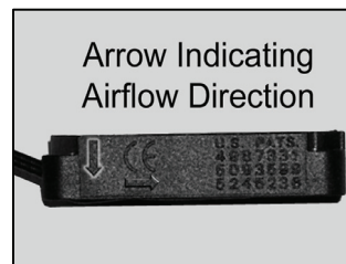
Figure 3: Check airflow direction