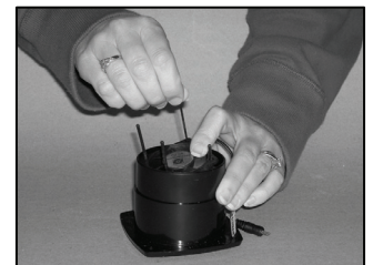
Figure 4: Reattach fan