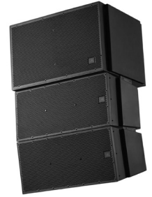
JBL VLA-C2100 Two-Way Full Range Loudspeaker with 2 x 10" Differential Drive® LF

To get started designing JBL VLA-C systems, use the JBL VLA Compact Line Array Calculator software, available at the JBL website . This software helps you determine: