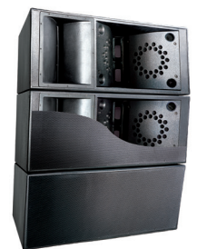
JBL VLAI Series Variable Line Array Loudspeakers